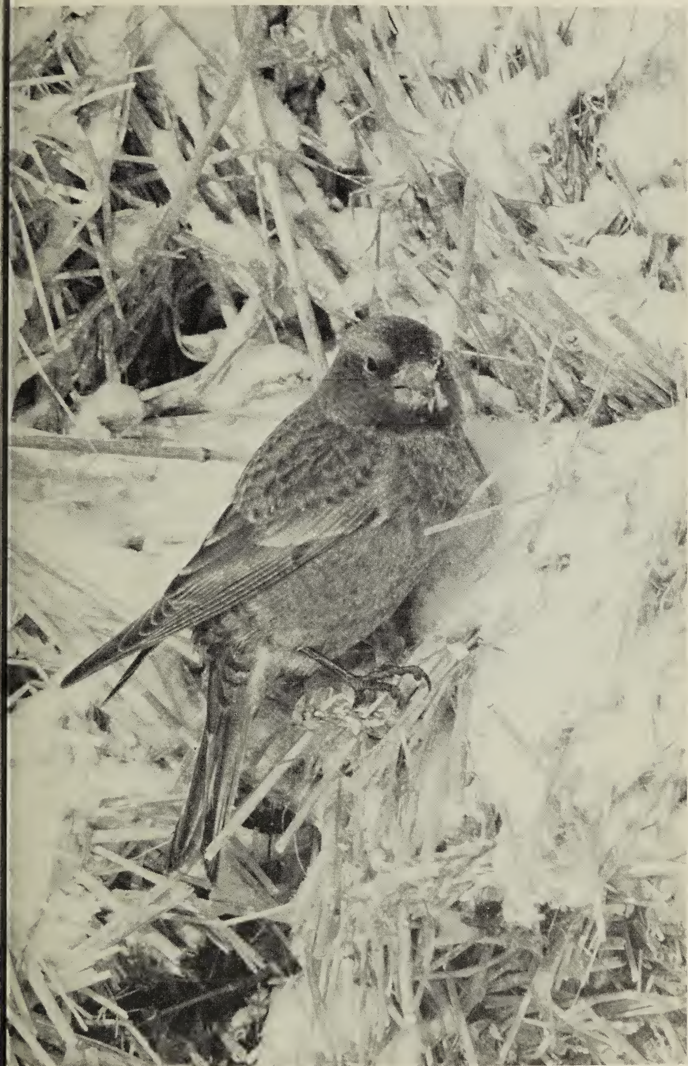
Gray-crowned Rosy Finch.