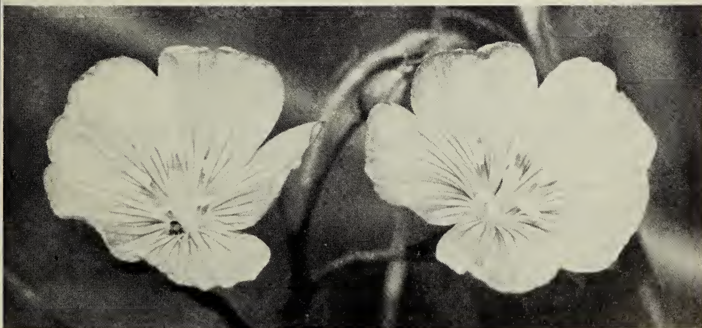
Wild Blue Flax.