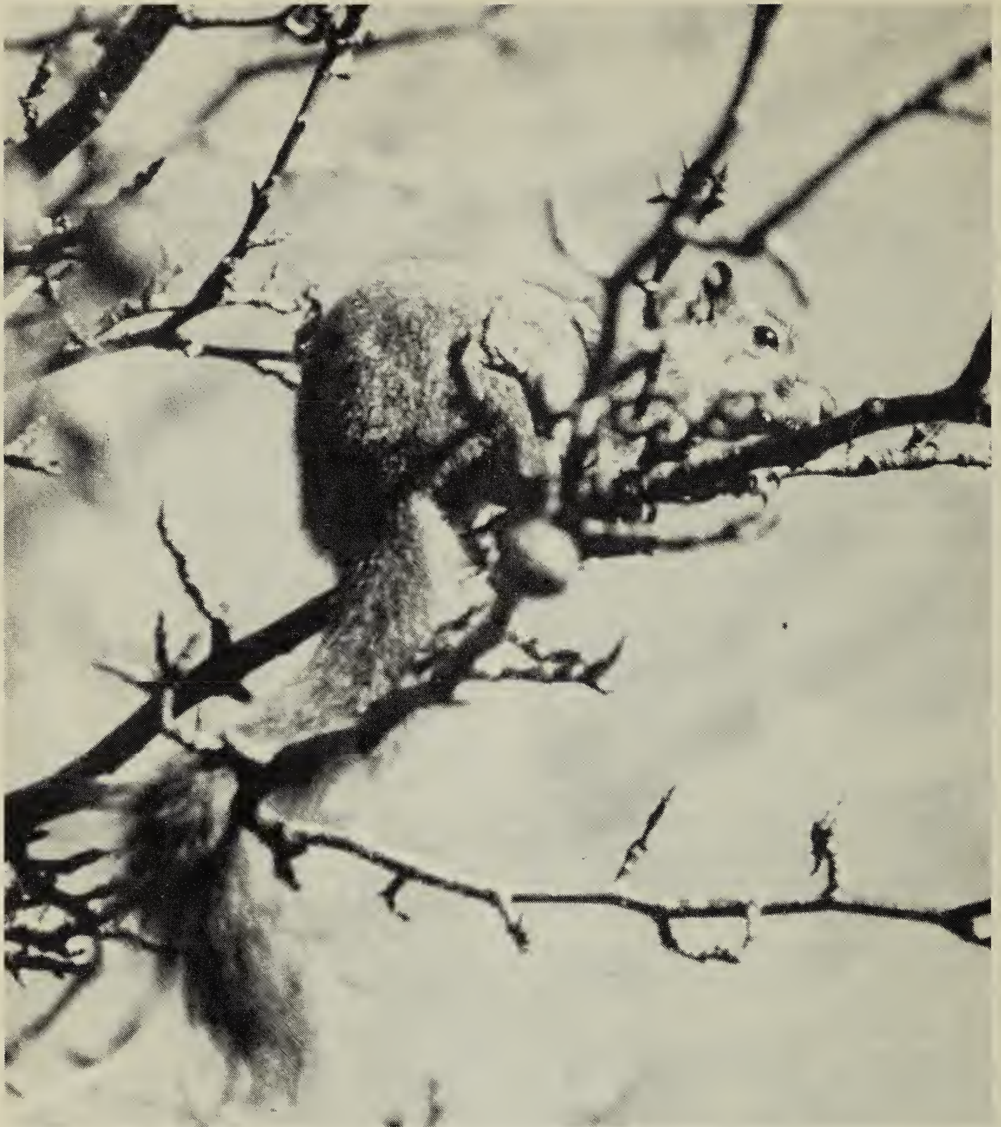
Figure 1. Fox Squirrel behind the Legislative Building, Regina, fall 1983.