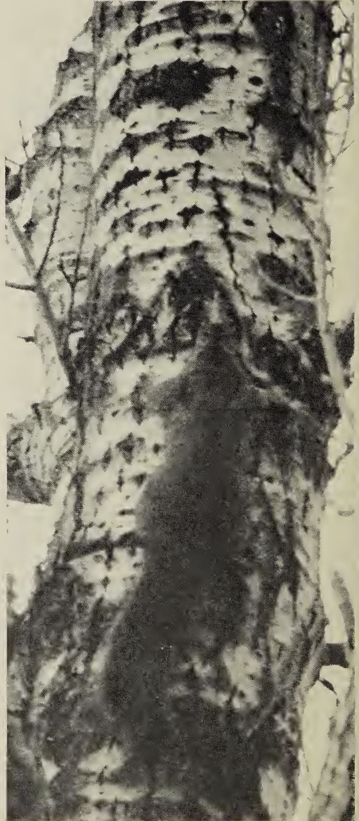
Figure 3. Typical freezing posture of Fox Squirrel!