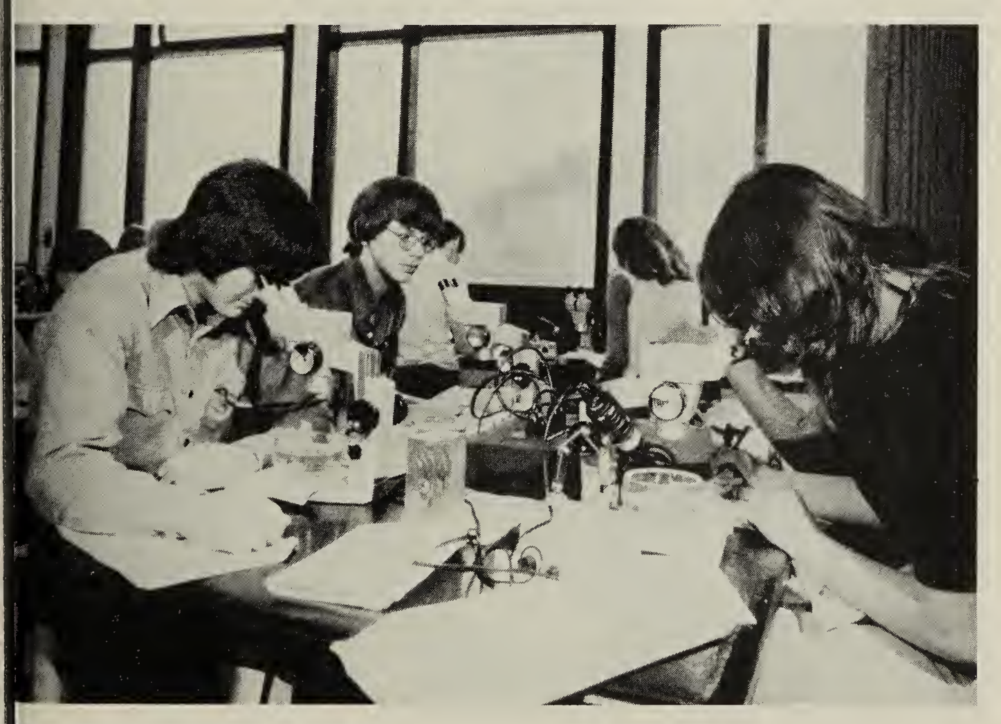
Students use aquarium educational laboratory facilities.