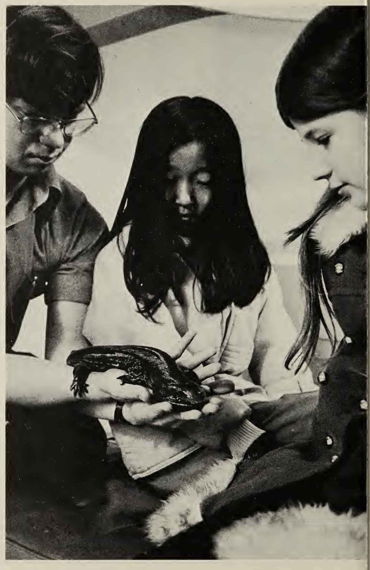
First hand experience with a salamander.