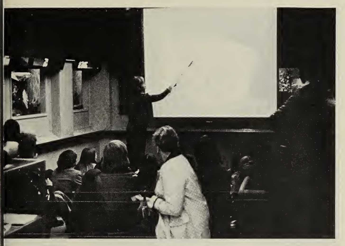
Volunteer presenting educational material to school children through visual aids. Craig Ferry