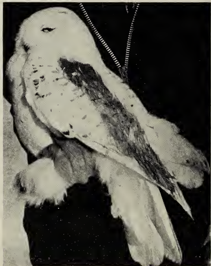
Coloured-marked Snowy Owls