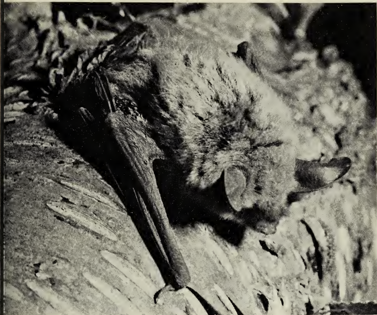
Say's Masked Bat on tall trunk