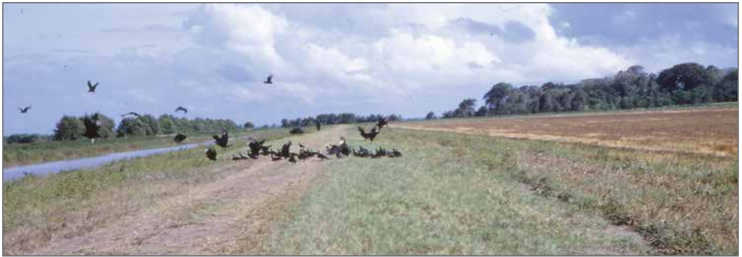
FIGURE 2. Black Vultures on access road through SML rice paddies.

to the North American Wildlife and Nature Resources Conference in 1971. 7 Each seat in the auditorium was taken as mercury contamination was then a new and hot topic. At the end of the presentation, a lively discussion ensued. We discussed the differences in uptake of mercury by seed-eating and fish-eating birds. Seed-eating birds obtained alkyl mercury compounds from feeding on mercury-treated grain and seeds, while birds feeding on fish and aquatic invertebrates acquire inorganic mercury or phenyl mercury compounds in the form of slimicides released by chlor-alkali plants and pulp mills. Mercury levels in fish-eating birds were observed to be much higher than those in seed-eating birds. Several questions were from people who had just initiated an investigation of mercury residues in birds. For example, a biologist from Saskatchewan, who had begun an investigation of mercury in muscle tissues of Ring-necked Pheasants, Gray Partridge and Sharp-tailed Grouse in the southern part of that province wanted to know about the relationship between mercury levels in eggs and muscles of those birds. He found that the levels of mercury in muscle tissue only in one case exceeded 0.05 parts per million. A biologist from Alaska who had