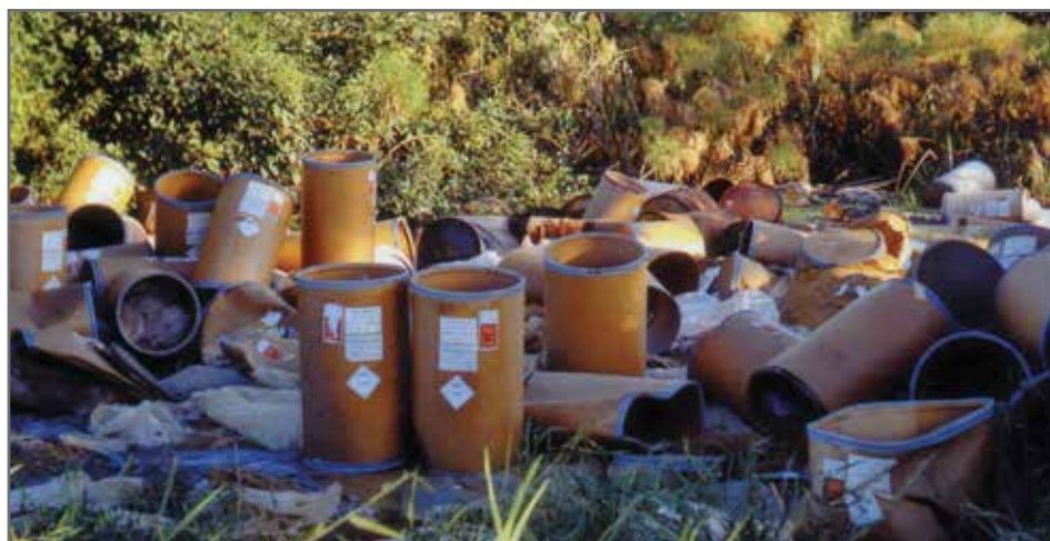
FIGURE 4. Disposal of NaPCP barrels. SML staff were advised to dispose the barrels safely as commercial preparations of NaPCP contain high levels of dioxin, a known teratogenic compound.

Not unlike a detective, I loved piecing together the effects of sodium pentachlorophenate (NaPCP), the molluscicide sprayed by airplane to kill Pomacea snails feeding on rice plants in the polders (Figure 4). Thousands of fishes were also killed in the rice paddies during the application of NaPCP (Figure 5). Many dead Snail Kites were found on their roosts in the brackish water marsh north of the polders as a result of eating the NaPCP contaminated snails in the adjacent rice fields (Figures 1, 6 and 7). Snail Kite organs were removed for pesticide analyses