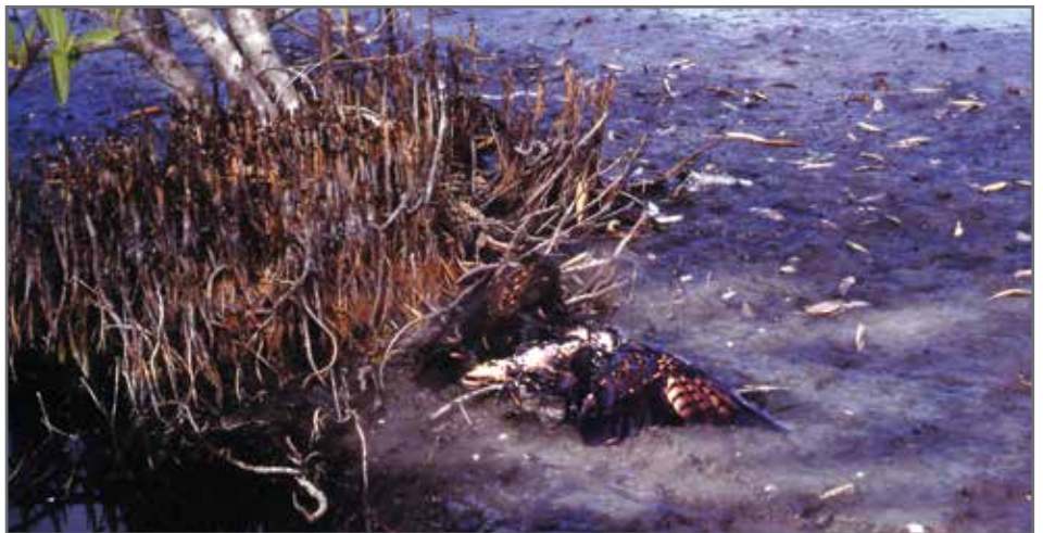
FIGURE 7. Dead Snail Kite beneath a black mangrove bush in brackish water marsh.

Several species of herons and egrets (8), caracaras, hawks, kites and vultures (10) and plovers, sandpipers