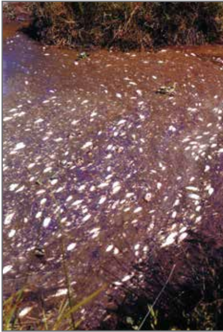
FIGURE 5. Fishes killed in rice paddy after aerial spraying of NaPCP. Chemical analyses showed high levels of pentachlorophenol in pooled samples of dead fishes.