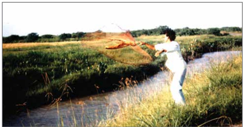
FIGURE 3. Local volunteer throws net to catch fishes in SML ditch. Fishes, which Common and Snowy Egrets feed upon, were analyzed for pesticide residues.

to the North American Wildlife and Nature Resources Conference in 1971. 7 Each seat in the auditorium was taken as mercury contamination was then a new and hot topic. At the end of the presentation, a lively discussion ensued. We discussed the differences in uptake of mercury by seed-eating and fish-eating birds. Seed-eating birds obtained alkyl mercury compounds from feeding on mercury-treated grain and seeds, while birds feeding on fish and aquatic invertebrates acquire inorganic mercury or phenyl mercury compounds in the form of slimicides released by chlor-alkali plants and pulp mills. Mercury levels in fish-eating birds were observed to be much higher than those in seed-eating birds. Several questions were from people who had just initiated an investigation of mercury residues in birds. For example, a biologist from Saskatchewan, who had begun an investigation of mercury in muscle tissues of Ring-necked Pheasants, Gray Partridge and Sharp-tailed Grouse in the southern part of that province wanted to know about the relationship between mercury levels in eggs and muscles of those birds. He found that the levels of mercury in muscle tissue only in one case exceeded 0.05 parts per million. A biologist from Alaska who had