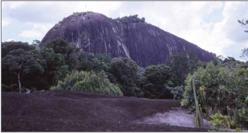
FIGURE 8. Voltzberg in Suriname.

Falls, a magnificent Harpy Eagle watched us. At night we slept in hammocks beneath the roof of an open building. I woke up frequently as Arie had told me to watch for vampire bats, which might suck your blood through the hammock. In the morning we were greeted by the loud calls of howling monkeys that sounded like distant thunder. In rock pools near the Falls, I watched with fascination giant electric eels moving around. We explored the area of the dome-shaped Voltzberg with its interesting flora growing in cirques on smooth granite flats (Figure 8). Unfortunately I did not see the bright orange Guianan Cock-of-the-Rock, which was known to occur near the Voltzberg.