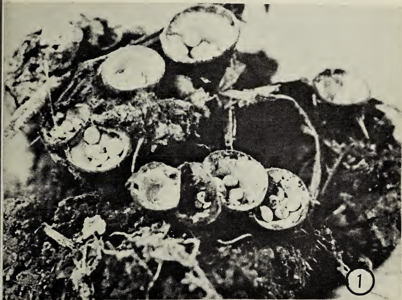
Fig. 1. Photograph of bird's-nest fungus Crucibulum, growing on plant and soil debris. Note peridioles (sporangioles) in the cups. Magnified X4.