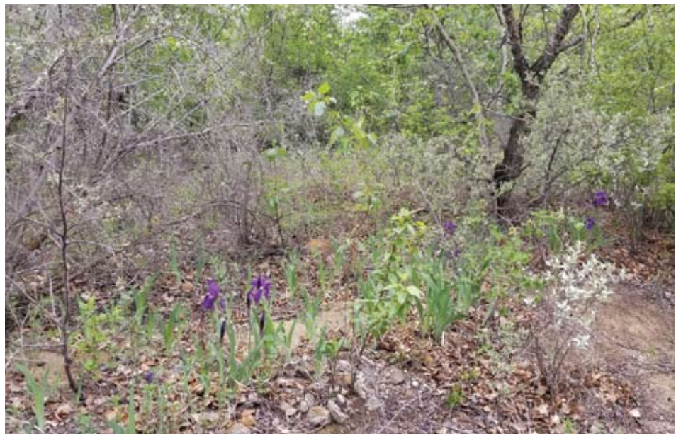
FIGURE 4. A snapshot of German iris habitat (vicinity of Hafford, Saskatchewan).

The obtained data show that the proportion of flowering plants in the study population of German iris substantially increased (from 15% to 26%) with a larger patch size (93 and 135 plants, respectively). A