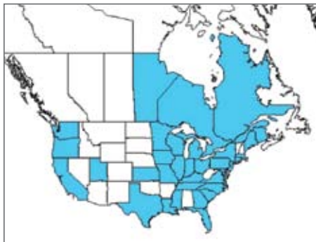
FIGURE 1. Distribution of German iris in North America (USDA, 2018).

German iris is a rhizomatous, perennial herb, growing to about 100 cm high, forming a large clump to 30 cm wide (Figure 2). Rhizomes are homogeneous, creeping on soil surface or to 10 cm depth, usually many-branched, light brown,