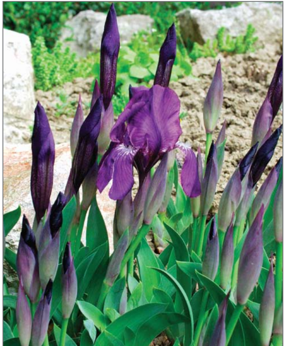
FIGURE 2. German iris in full bloom.