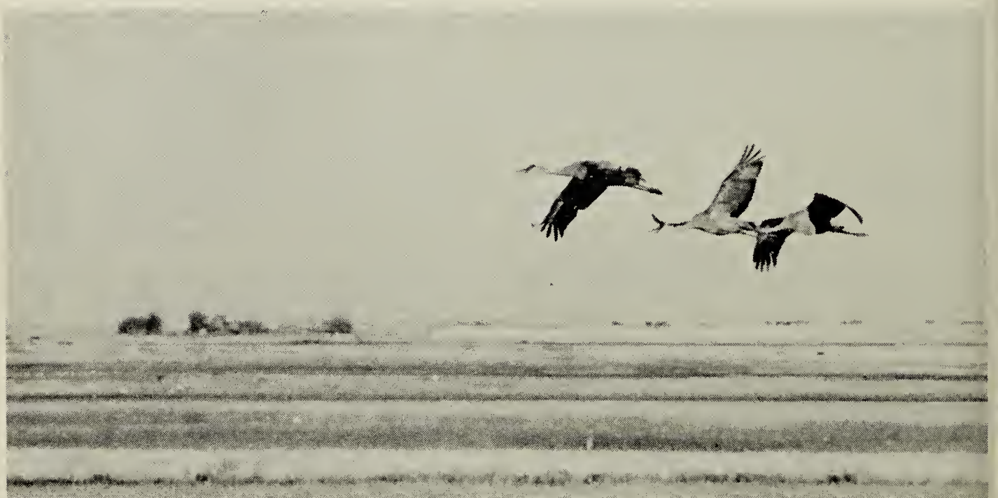
Sandhill Cranes in Last Mountain Lake Wildlife Area

SANDHILL CRANE. Abundant migrant, rare summer visitor. During day in grain fields or prairies around