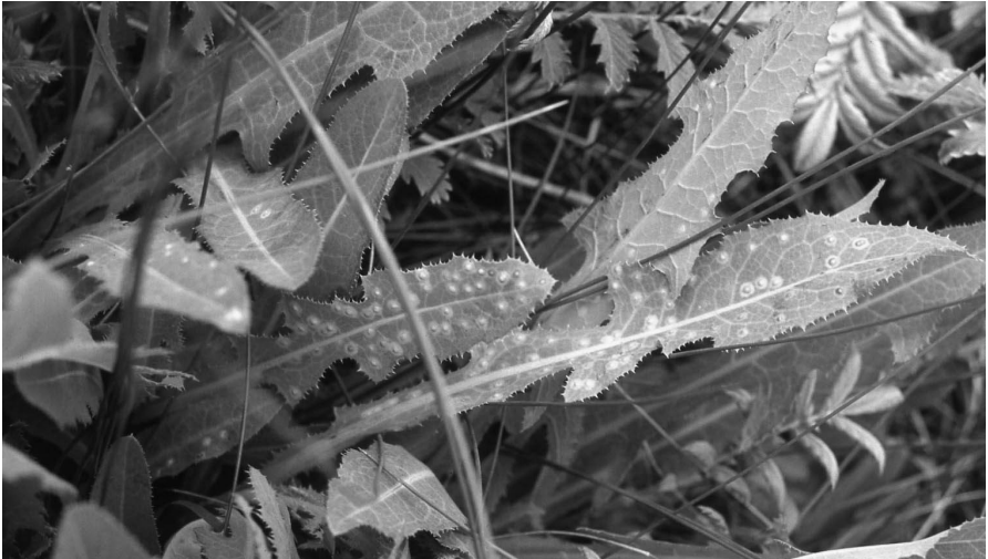
Figure 2. Yellowish-green blister galls on top surface of a leaf of the perennial sow-thistle produced by the larvae of the sow-thistle midge (see inside front cover for close-up colour image) -D. Peschken