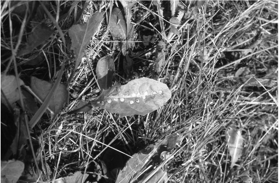
Figure 5. Reddish-green blister galls on a dandelion leaf produced by the dandelion midge. D. Peschken

been accidentally introduced into Canada from abroad.