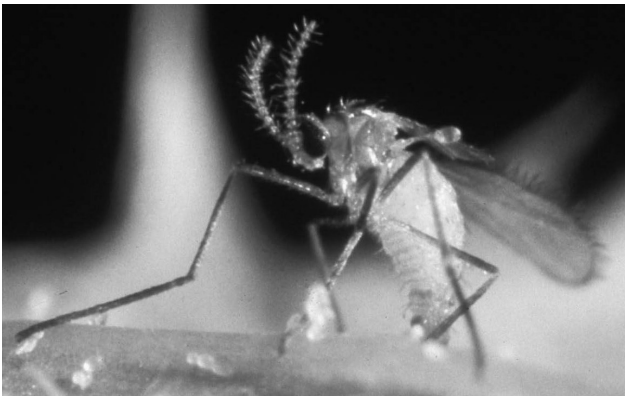
Figure 1. Sow-thistle midge laying an egg through stomatal opening on the underside of leaf of perennial sow-thistle.

Originally imported from Europe by Agriculture Canada, the sow-thistle midge was released as a biological control agent to help