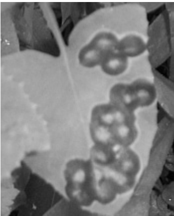
Figure 3. Reddish blister galls on top of a leaf of the perennial sow-thistle produced by the larvae of the sow-thistle midge. (see inside front cover for close-up colour image) D. Peschken

control weedy sow-thistle species in British Columbia, Alberta,