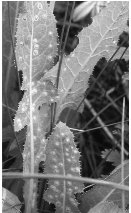
Blister galls on perennial sow-thistle.