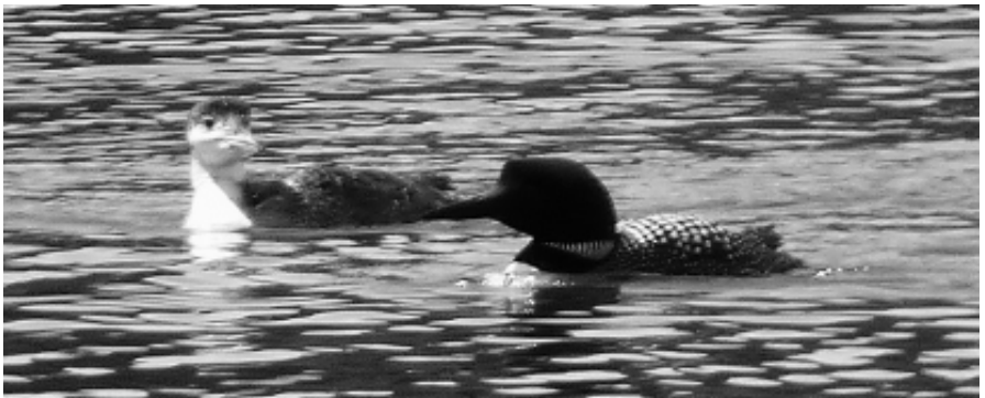
Figure 3 Loons - sub-adult left adult right

Wisconsin. 10 Researchers there found that of the hundreds of loons seen each summer, only one or two would be in basic plumage (J. Mager, pers. comm.). Usually they remain on large lakes used only for foraging, not for breeding. This behaviour of breeding lake avoidance might be expected as territorial pairs are very aggressive towards intruders. 10 Although hundreds of adults and chicks have been banded in the Wisconsin study area over two decades, a banded loon in basic plumage has not been seen in early summer; these authors suggest that these loons could be "prebreeders" but without marked individuals, one can only speculate as to the age and identity of these birds.