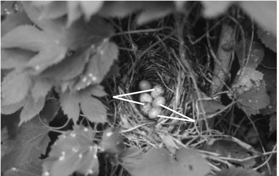
Figure 4 - Veery nest containing five Brown-headed Cowbird eggs plus one Veery egg, forested dune ridge, Delta Marsh, 16 June 1980. Note: immaculate Veery egg is the top-most egg; two sets of connected pointers indicate cowbird eggs that were likely laid by the same females; the fifth cowbird egg (apparently laid by a third female) is immediately beneath the Veery egg.

Multiple egg laying occurs frequently among most of the species of obligate parasitic cowbirds ( Molothrus spp.), but in some cases this would not be considered dump nesting, even if the host’s nest eventually contained only cowbird eggs. To illustrate this point, all Veery ( Catharus fuscescens ) nests parasitized on our study area at Delta Marsh over 16 years (14 of 21 nests, 66.7% parasitized) received more than one cowbird’s egg — one nest had five cowbird eggs plus one Veery egg (Fig. 4), another held seven cowbird eggs and one Veery egg. The first nest was depredated, whereas the second nest produced only cowbirds. More than one cowbird apparently laid eggs in the first nest, as suggested by a comparison of the spot patterns among the five cowbird eggs in the nest (see pointers in Fig. 4): three fairly distinct patterns can be identified, which suggests