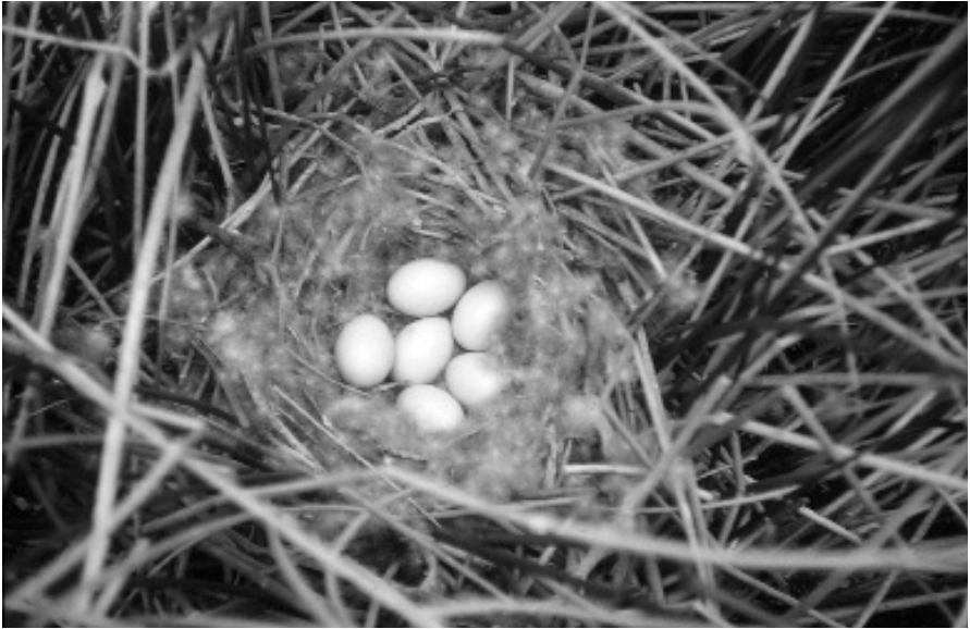
Figure 1 - "Typical" nest of Redhead constructed over water at the edge of a clump of bulrushes, about 10 km south of Battleford, Saskatchewan, 14 June 1960.

also females of other species laying in the same nest until there are, in many cases, dozens of eggs piled in several layers. These nests, often referred to as "dump" nests, 6,10 begin as active nests and, hence, attract laying females. Eventually the host female cannot incubate any more eggs and, not knowing which ones to discard, abandons the nest; usually most or all of the eggs do not hatch. 3,6 Dump nests have puzzled biologists because so many eggs appear to be wasted. Here I describe a Redhead "dump" nest at Delta Marsh, Manitoba and compare anecdotally aspects of multiple laying by facultative and obligate brood parasites, using examples from the work of me and my students on cowbird parasitism at Delta Marsh.