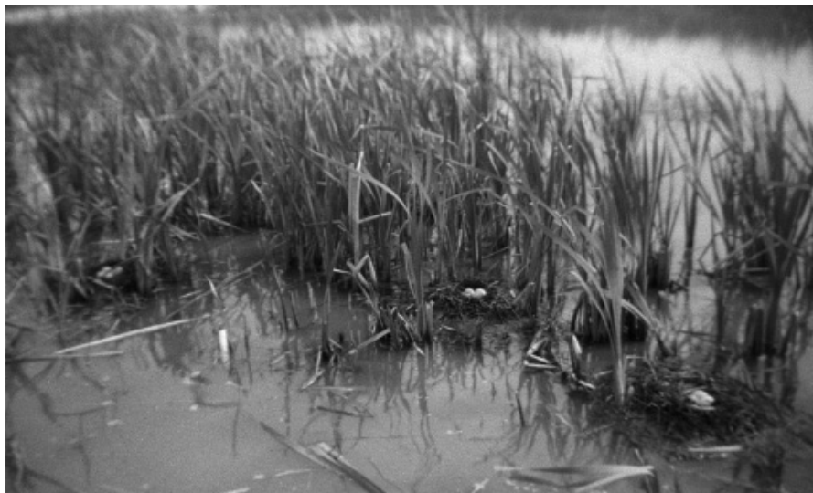
Figure 3 - Portion of a colony of Eared Grebes showing eggs in three nests anchored to new growth in a cattail marsh, about 8 km west of Kindersley, Saskatchewan, late June 1957.

Dump nests among waterfowl are not restricted to the Redhead, but have been recorded frequently in hole- and cavity-nesting ducks such as Wood Duck ( Aix sponsa ) and goldeneyes ( Bucephala spp.) where individuals may face a shortage of adequate nest sites. In these species, however, reproductive success of the hosts is not always compromised. 7,8 Gollop wondered whether Eared Grebes ( Podiceps nigricollis ), which are known to parasitize each other's nests, 18 have dump nests, as he discovered several "conglomerations" of Eared Grebe eggs — one with 101 eggs, a second with 94 eggs — at a large slough north of Mantario, Saskatchewan, in 1958. 19 The eggs were laid by multiple females on mats of dead vegetation, not in nests, as Redhead dump nests generally are, and within a few metres of active nests. None of the eggs appeared to have been incubated. Gollop's observations apparently are the only records of such nests reported for the Eared Grebe. 20 I have never observed dump nests in any of the 25 or so Eared Grebe colonies