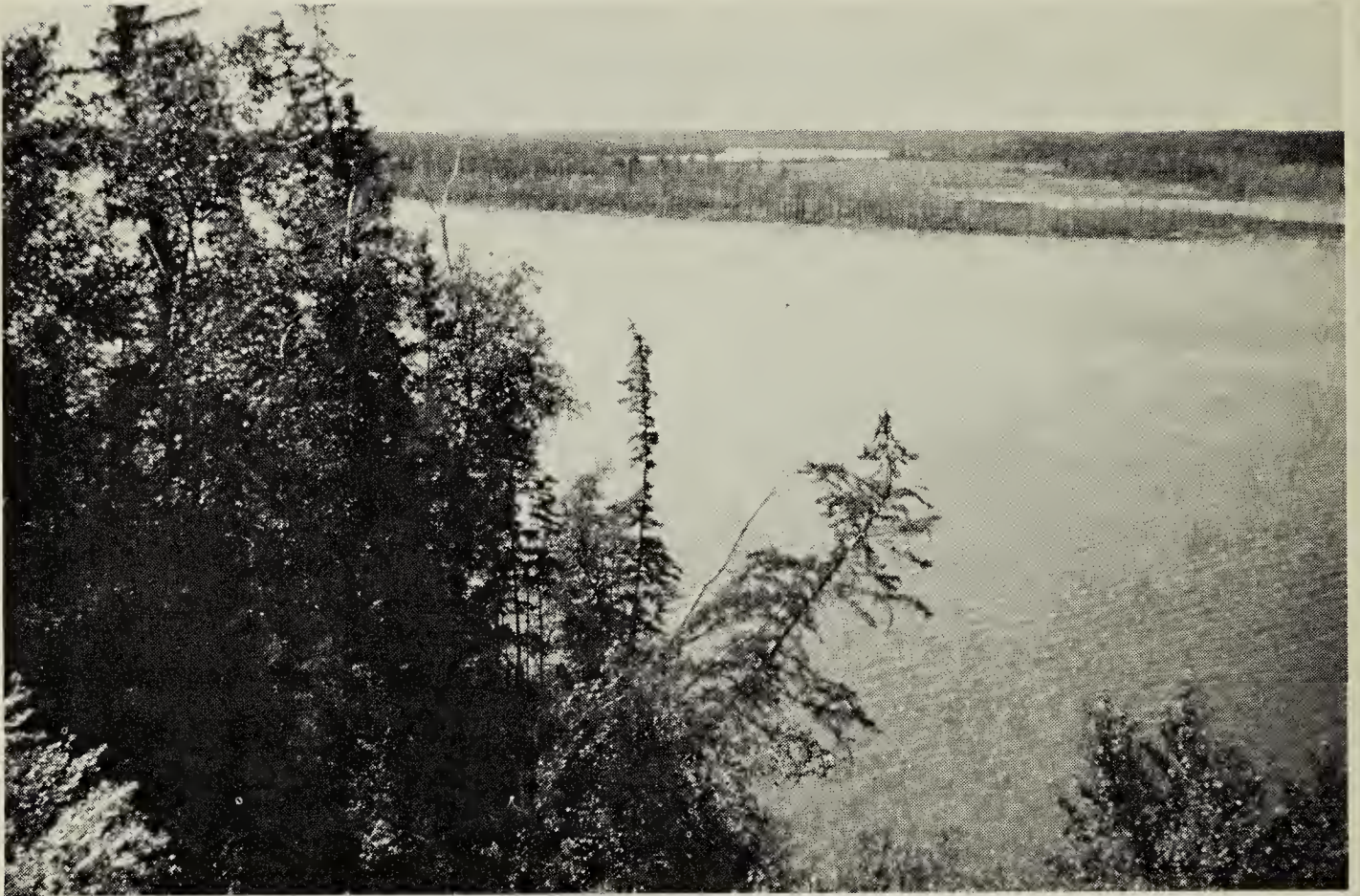
Saskatchewan River at Maurice Street Wildlife Sanctuary.