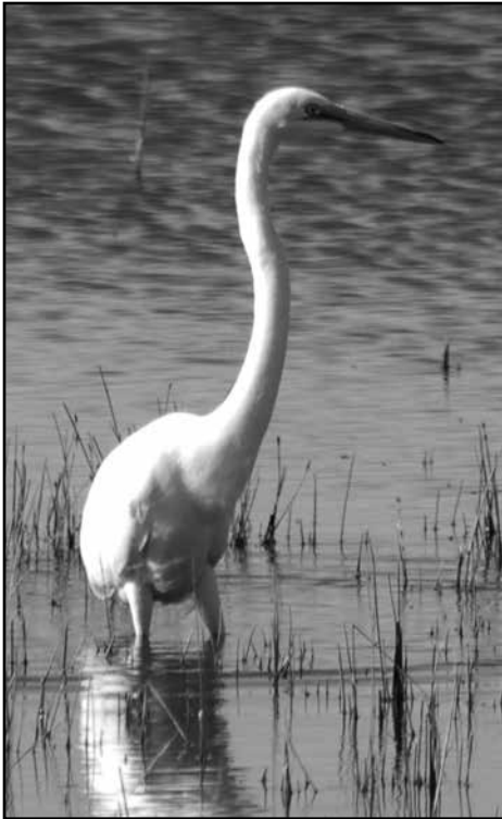
Great egret (Ardea alba), photographed at Highfield Dam, southwest of Herbert, SK, on 27 September 2010. The last time it was seen was on 3 October.