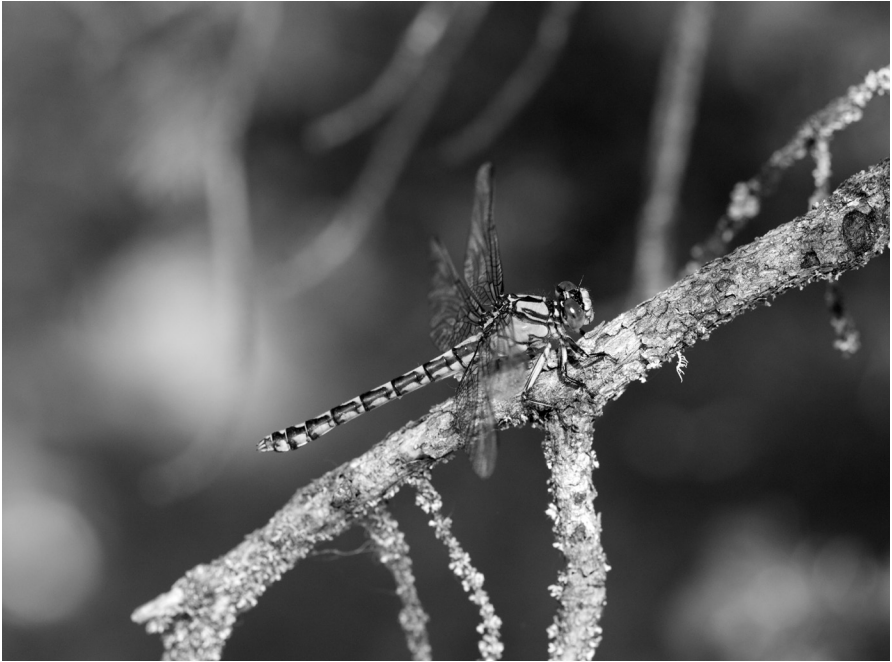
Figure 3 - Clubtail dragonfly