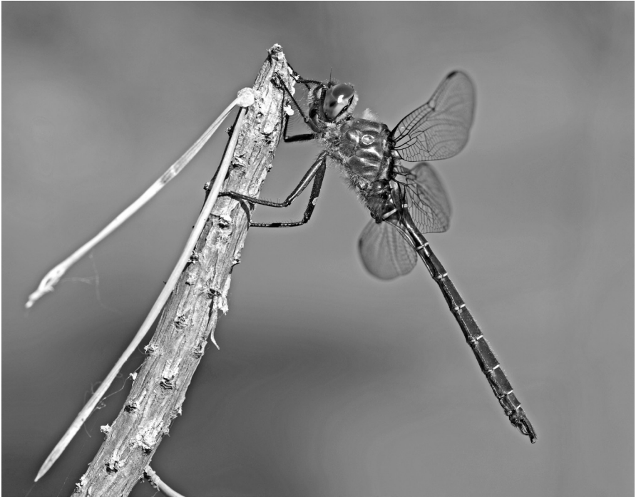
Figure 2 - Emerald dragonfly (colour image outside back cover)

Unfortunately the bird survey ended in disappointment, but long faces were quickly transformed into smiles when participants were given the opportunity to handle and tag northern saw whet owls at a number of nest boxes Harold maintains for that purpose.