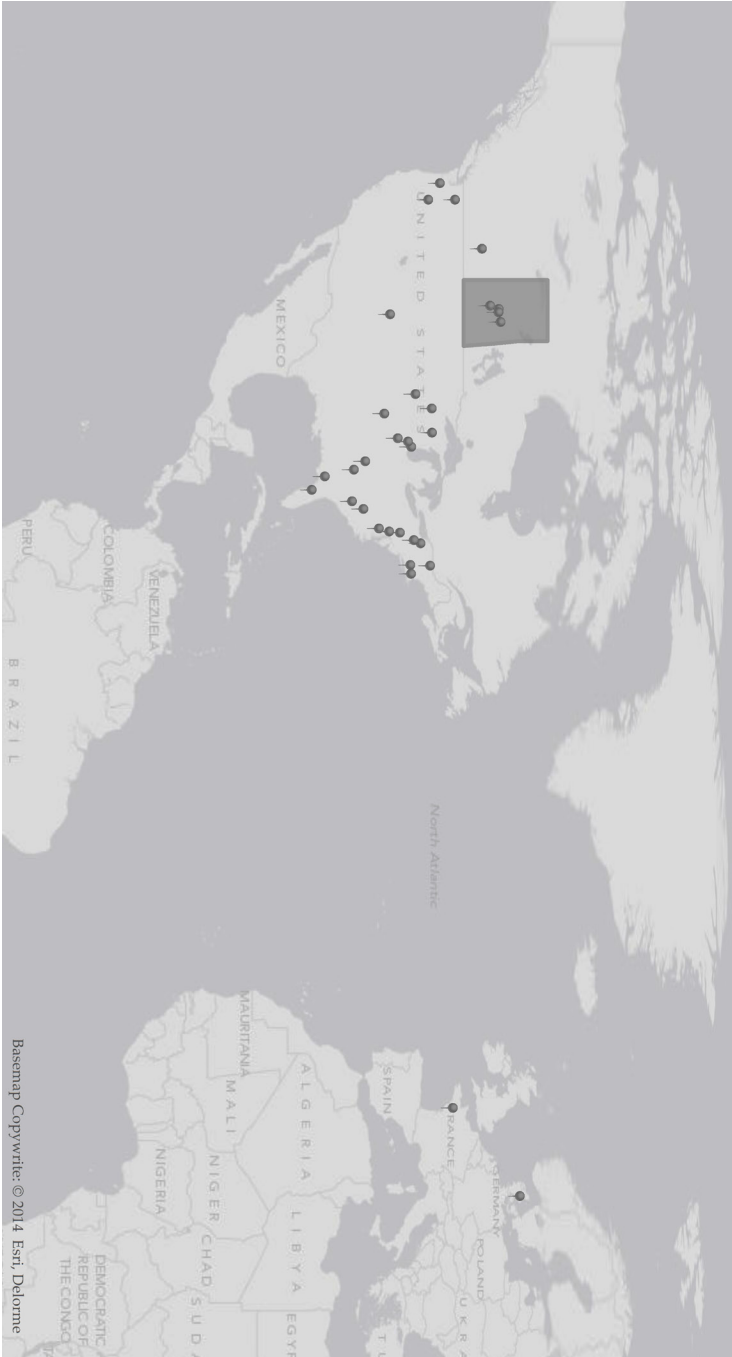
Figure 1 - Map showing of participant home locations