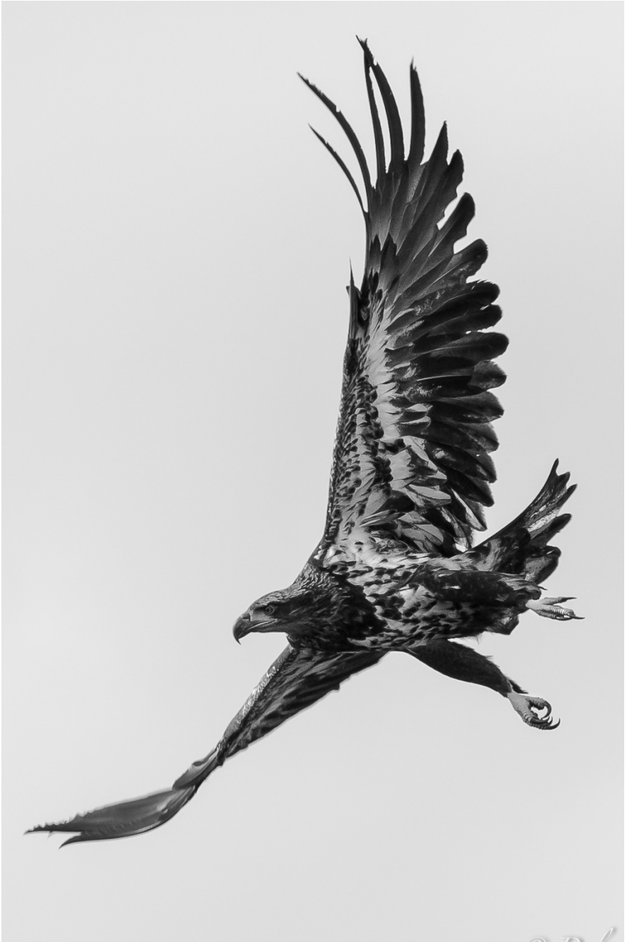
Figure 10 - Subadult bald eagle at McCulloch Island, 2013