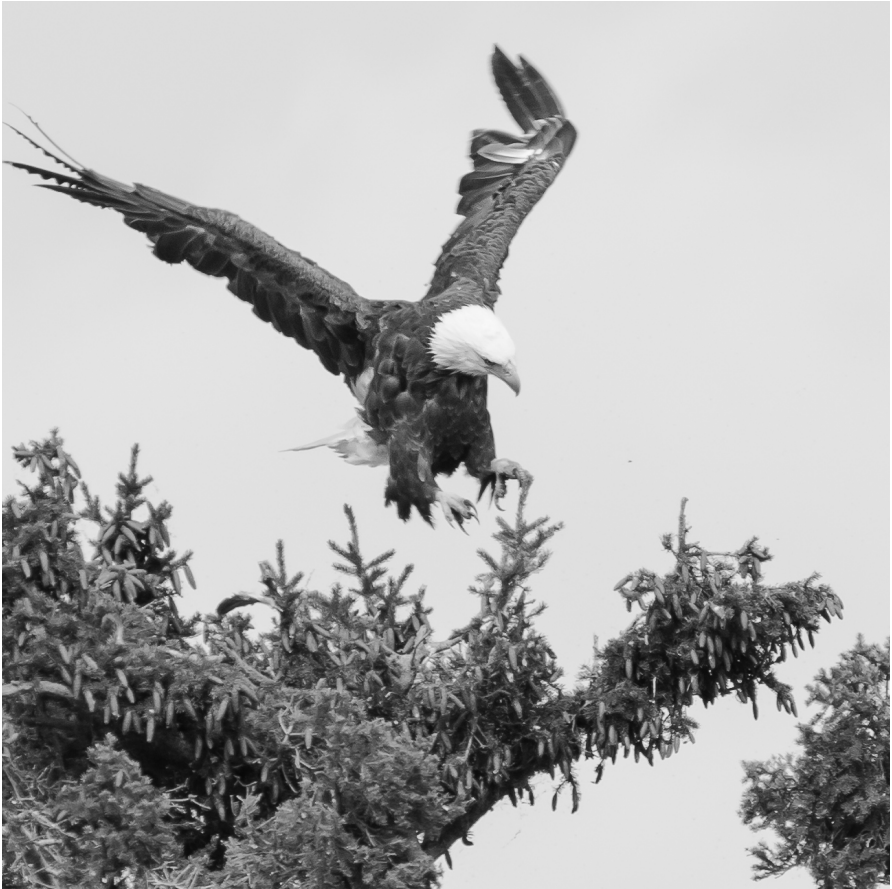
Figure 9 - Adult, Lisee nest.

The author acknowledges the support and encouragement of Stuart Houston. Mark Duffy provided valuable information about fish stocks at Lac LaRonge.