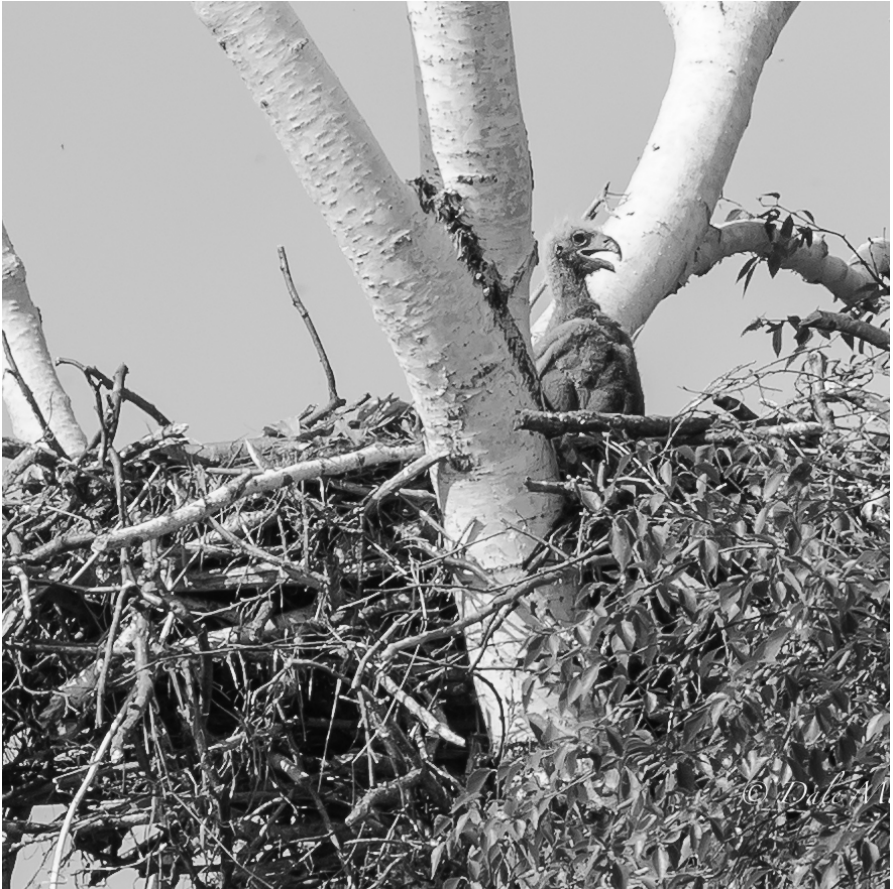
Figure 3 - Nestling, 18 June 2013 at Lisee nest.

Amber, the female young Bald Eagle that I observed in 2013, was sitting in the nest at the Lisee site on 18 June 2013 (Fig. 3).