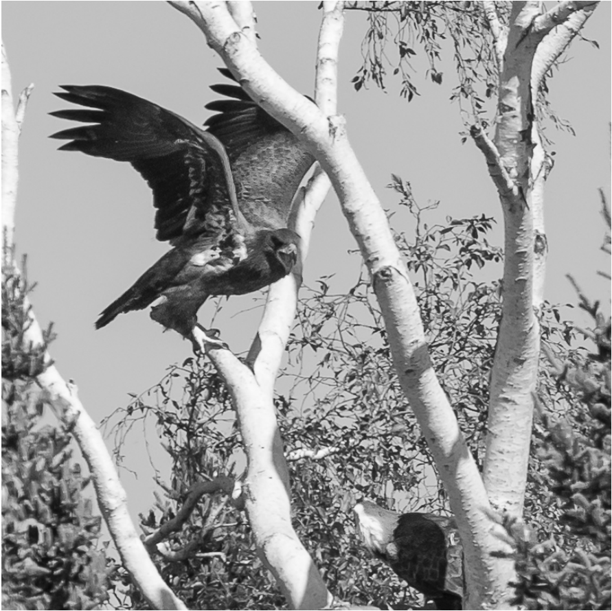
Figure 6 - Lisee nest, fledgling being fed by adult.

While this could have had an effect on shallow water fish populations, these fish are more sensitive to a decline in water levels than an increase. There is no evidence that the populations of burbot ( Lota Lota ), sucker ( Catostomus commersonii ) or cisco ( Coregonus artedi ) are on the decline at Lac La Ronge. 4 It is possible, though, that the high water levels had an adverse effect, not on the number of fish, but on the availability of shallow water fish to feeding Bald Eagles.