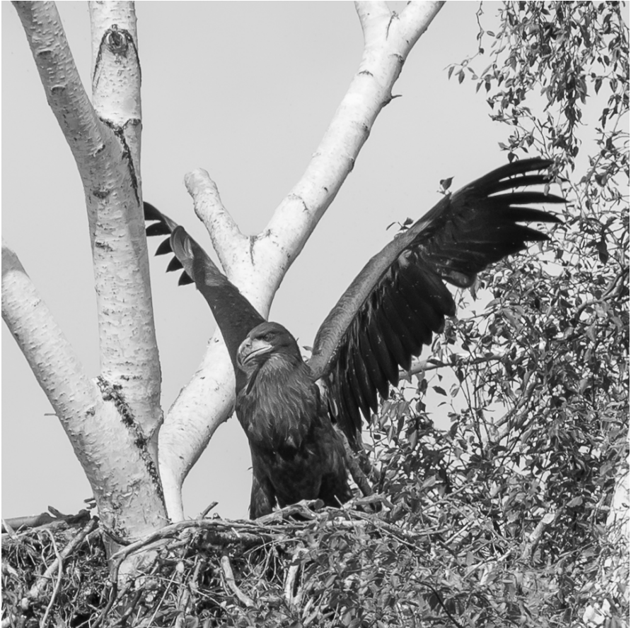
Figure 5 - Nestling strengthening wings, Lisee nest

unusually harsh weather is one of the more likely explanations for the low number of active nests on Lac LaRonge in 2013.