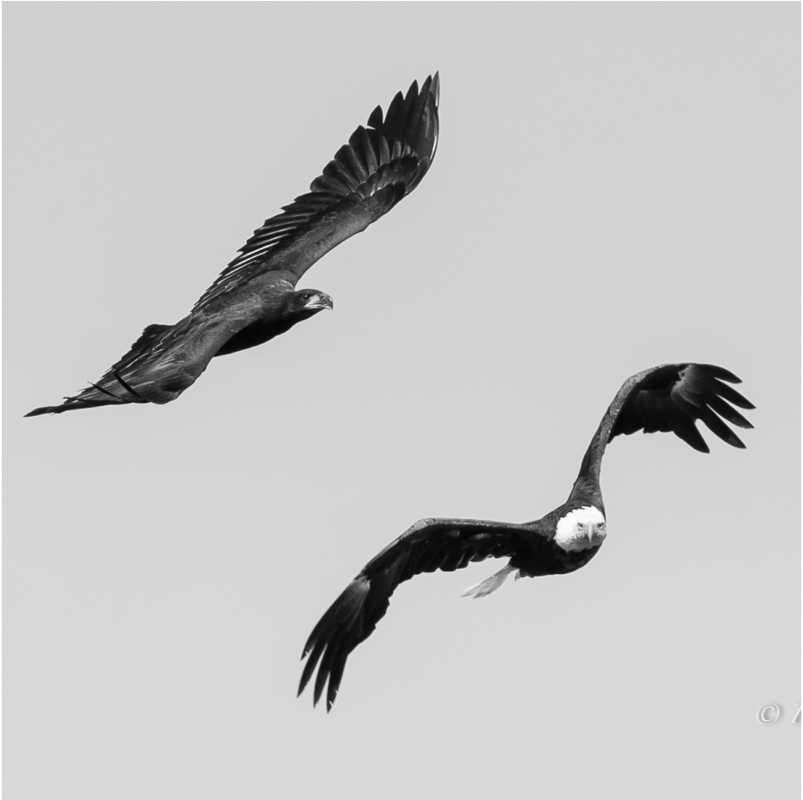
Figure 7 - Adult and juvenile, late August 2013, Lisee site

area under observation. These subadult birds remained fairly close to the eight nests that did not produce a fledgling, including the nest at the McCulloch site. Adult Bald Eagles protect an active nest with some vigor. However, eagles with empty nests do not seem to be nearly as territorial. The one-year-old bird that fledged at the McCulloch site in 2012 returned to the nesting area on McCulloch Island in 2013. However, I did not