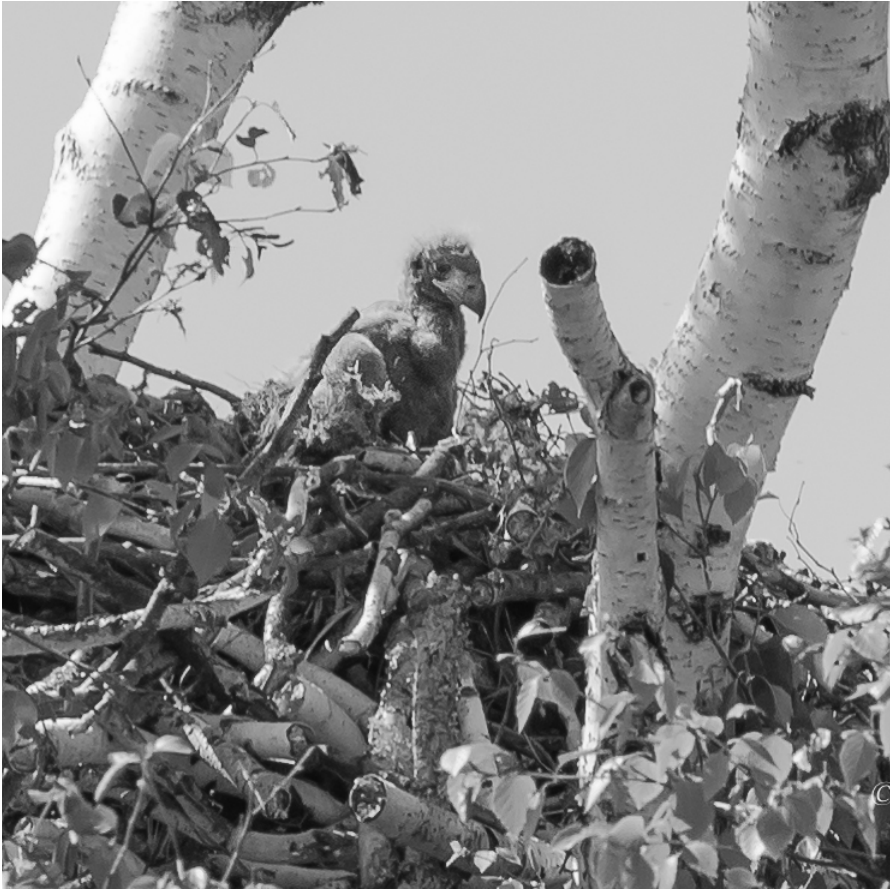
Figure 2 - Nestling, 16 June 2013 at McCulloch Island nest

I did not see the fledgling at the La Ronge site, but I might have not noticed it because I visited it rarely. Using distinctive developmental features of the head and distinct feather patterns I believe two of the birds that fledged in 2012 returned to the area 2013.