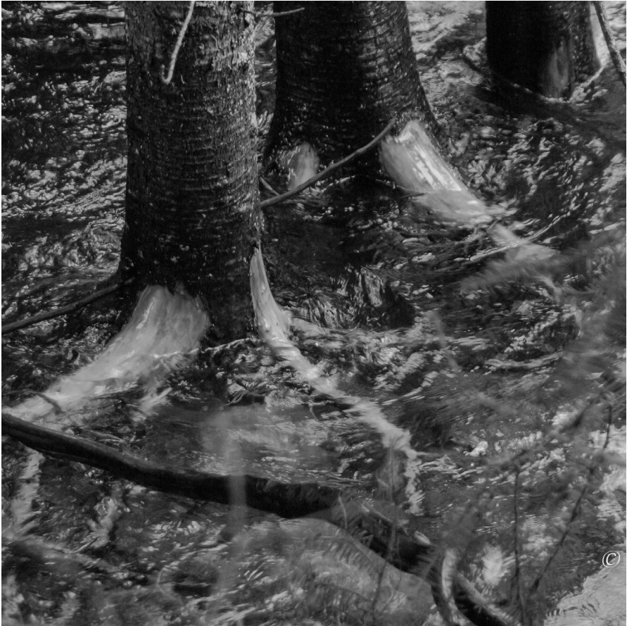
Figure 8 - High water levels around tree roots, Lac LaRonge, spring 2013

at all disturbed by the presence of the one-year-old even though the nest did produce young that did not survive past 16 June. I did not see any sub adult eagles within a kilometer of the Lisee site in the summer of 2013. This observation is curious because there is evidence that sub adult Bald Eagles in the Chesapeake Bay area rarely return to their lake of origin. 4 This might not be the case in the Lac La Ronge area.