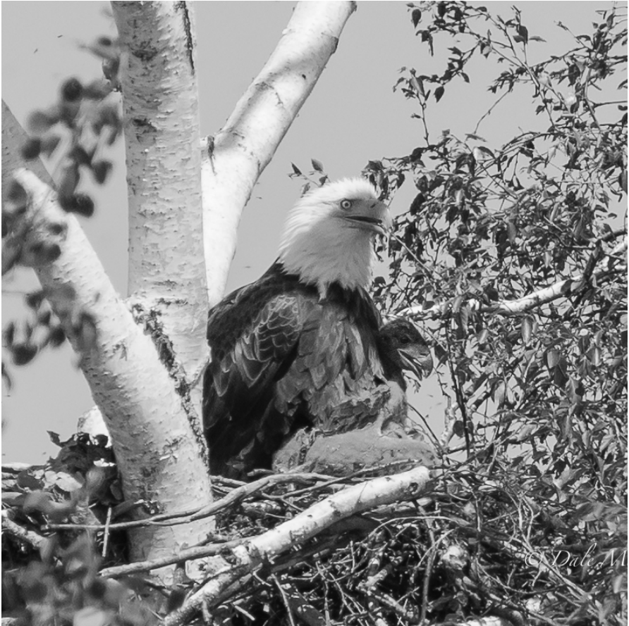
Figure 4 - Adult with nestling, note dead chick on side of nest. 2 July 2013, Lisee nest

1. It could just be an extreme variation of normal.