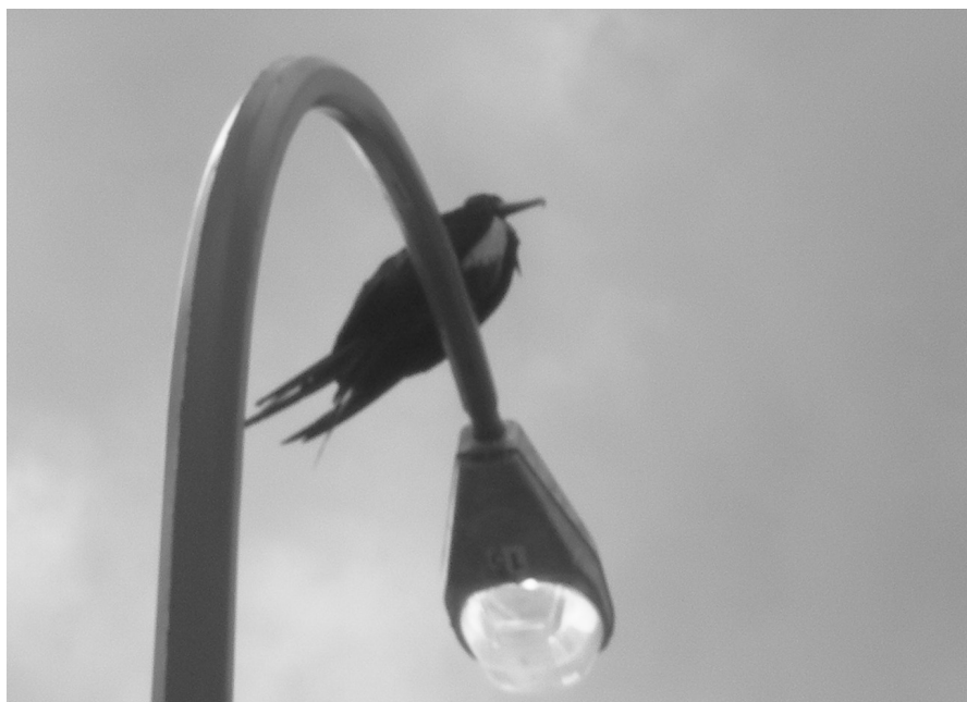
Adult frigatebird on post (July 2010), note white plumage - Jackie and Ron Simpson