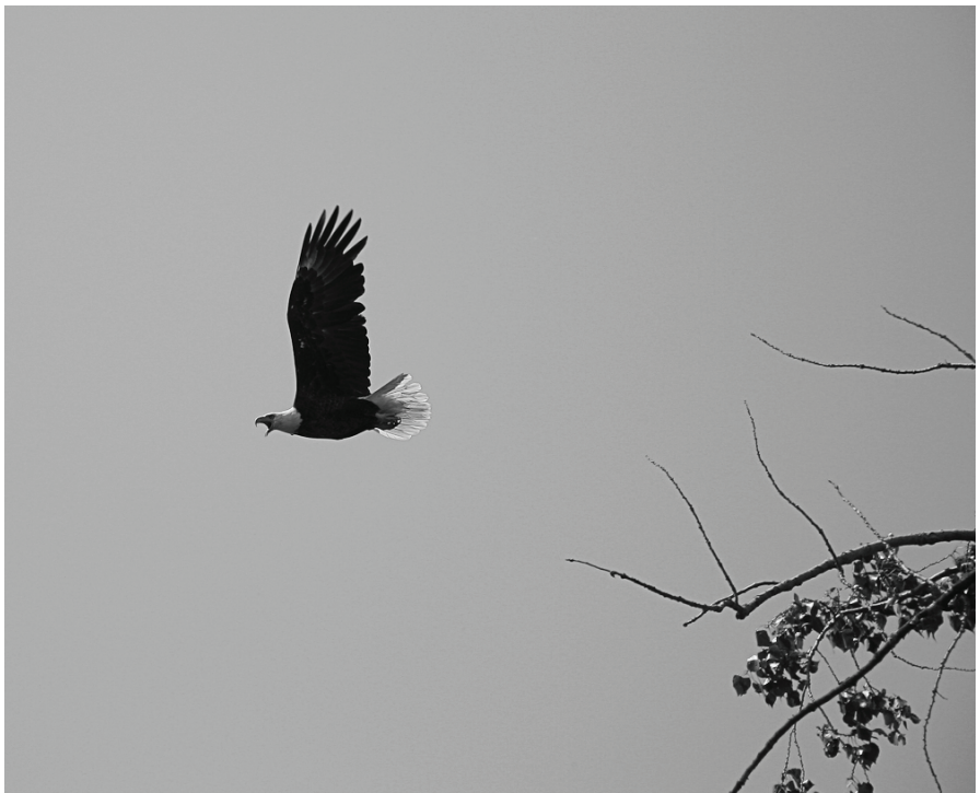
Top: Close-up of eagle nest. Bottom: Adult eagle leaving nest.