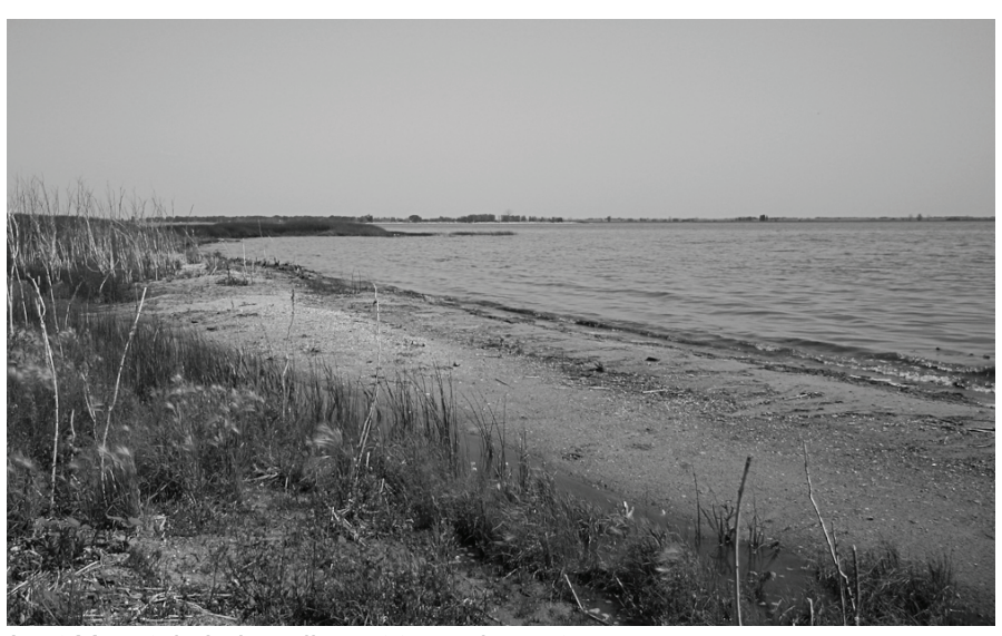
Last Mountain Lake adjacent to eagle nest.