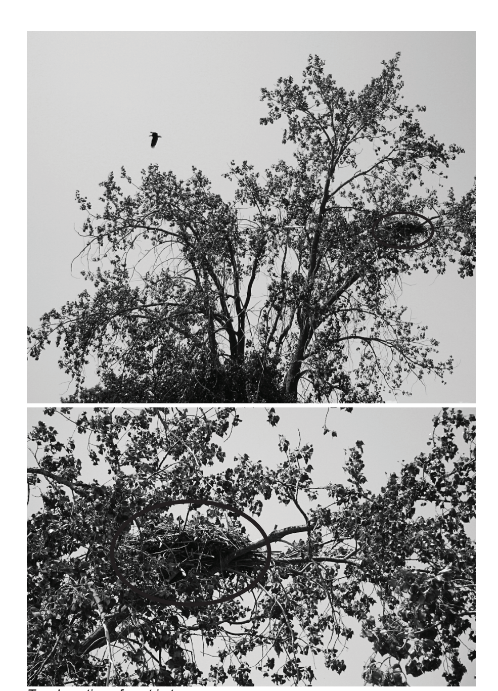
Top: Location of nest in tree. Bottom: Closer view of eagle nest.