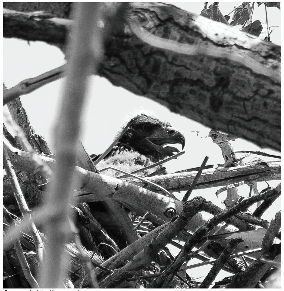
An eaglet in the nest.