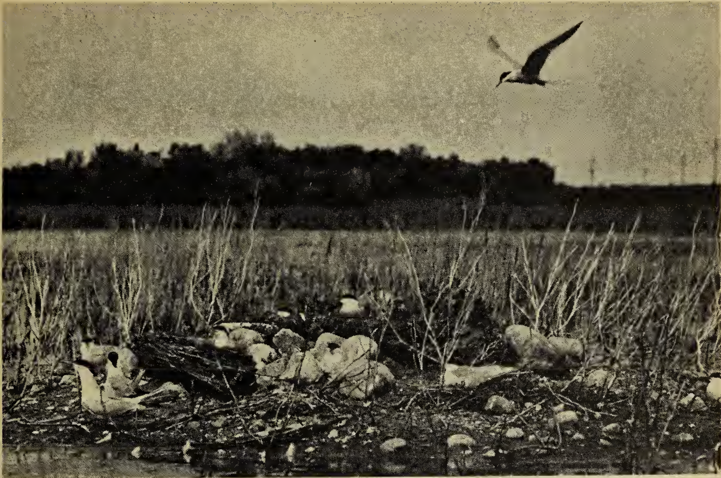
Breeding colony of Common Terns at Tern Island, 1962

Blackbirds' nests were destroyed by the 95 m.p.h. gusts of wind. The water level up to June 23 was well above the previous year's high, the spring run-off having filled the creek. No waterfowl nests seemed to be in danger of being left high and dry before the young left, and there was ample water for all species.