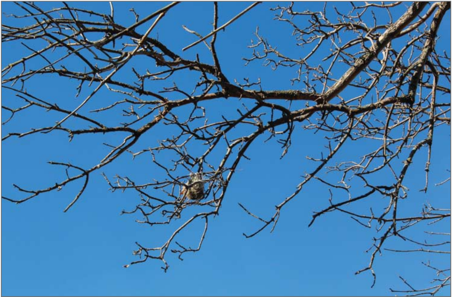
FIGURE 2. Pensile nest of the Baltimore Oriole, this one suspended in a Green Ash ( Fraxinus pennsylvanica ). The nest became visible after leaf-fall in the autumn.

in 1977 (3.8; n = 37). Mean brood size was significantly larger in 1976 than in 1977 (3.8; n = 37). Sample sizes I used to calculate nest success were greater than those for mean brood size because fledging of at least one young was recorded at some inaccessible nests where brood size was not determined. 3