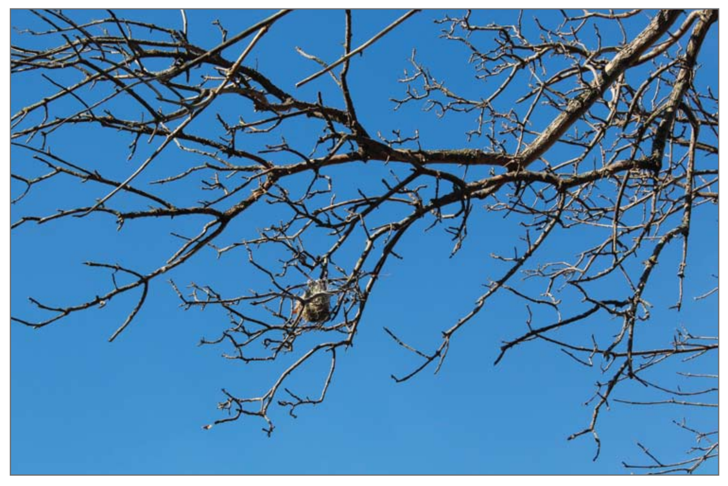
FIGURE 2. Pensile nest of the Baltimore Oriole, this one suspended in a Green Ash (Fraxinus pennsylvanica). The nest became visible after leaf-fall in the autumn.

in 1977 (3.8; n = 37). Mean brood size was significantly larger in 1976 than in 1977 (3.8; n = 37). Sample sizes I used to calculate nest success were greater than those for mean brood size because fledging of at least one young was recorded at some inaccessible nests where brood size was not determined.<sup>3</sup>