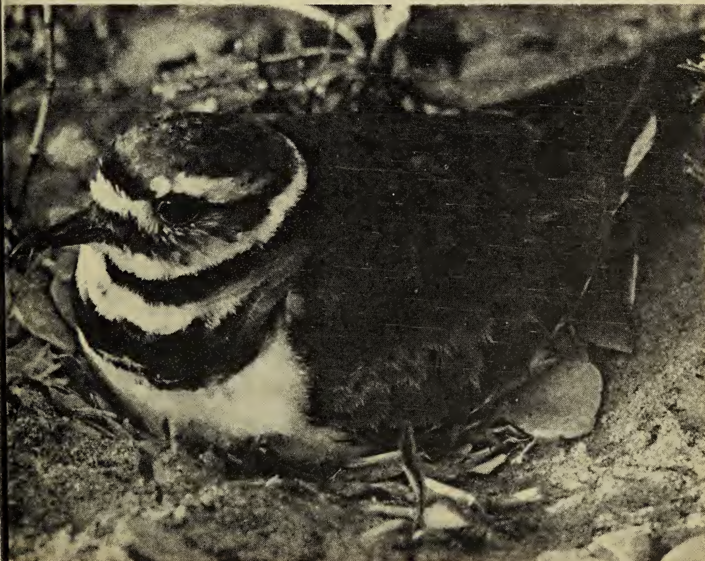
Killdeer on Nest