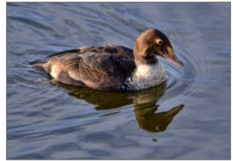
King eider.