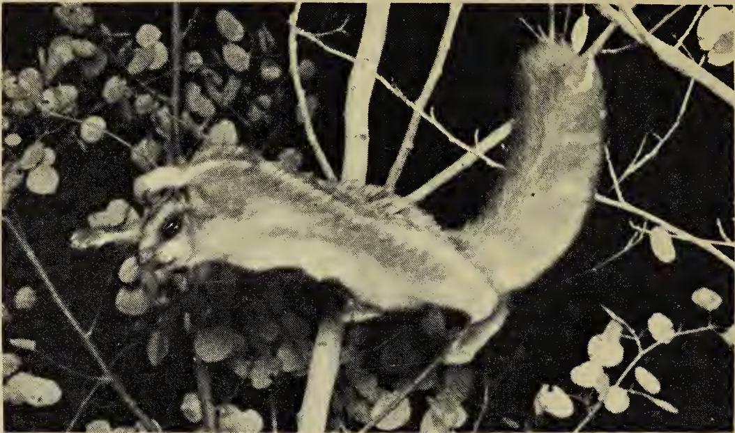
The Northern Flying Squirrel can glide about 150 feet or more. (Note the position of the head.)