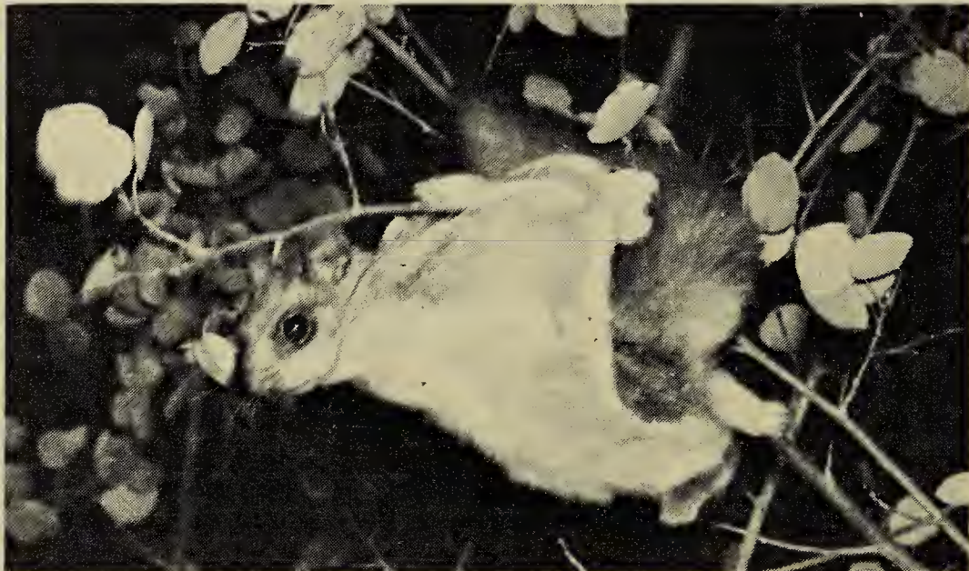
The loose furry membrane is further extended by cartilages from the fore limbs.