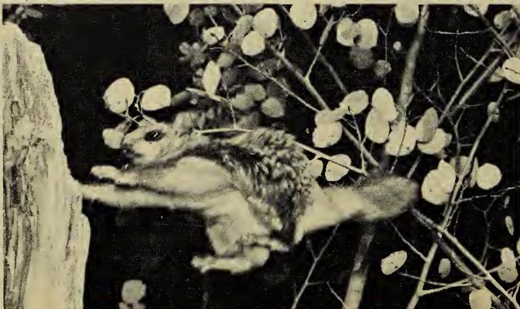
Before landing the squirrel checks its speed by manipulating its tail and it comes to rest head up on the trunk of a tree.