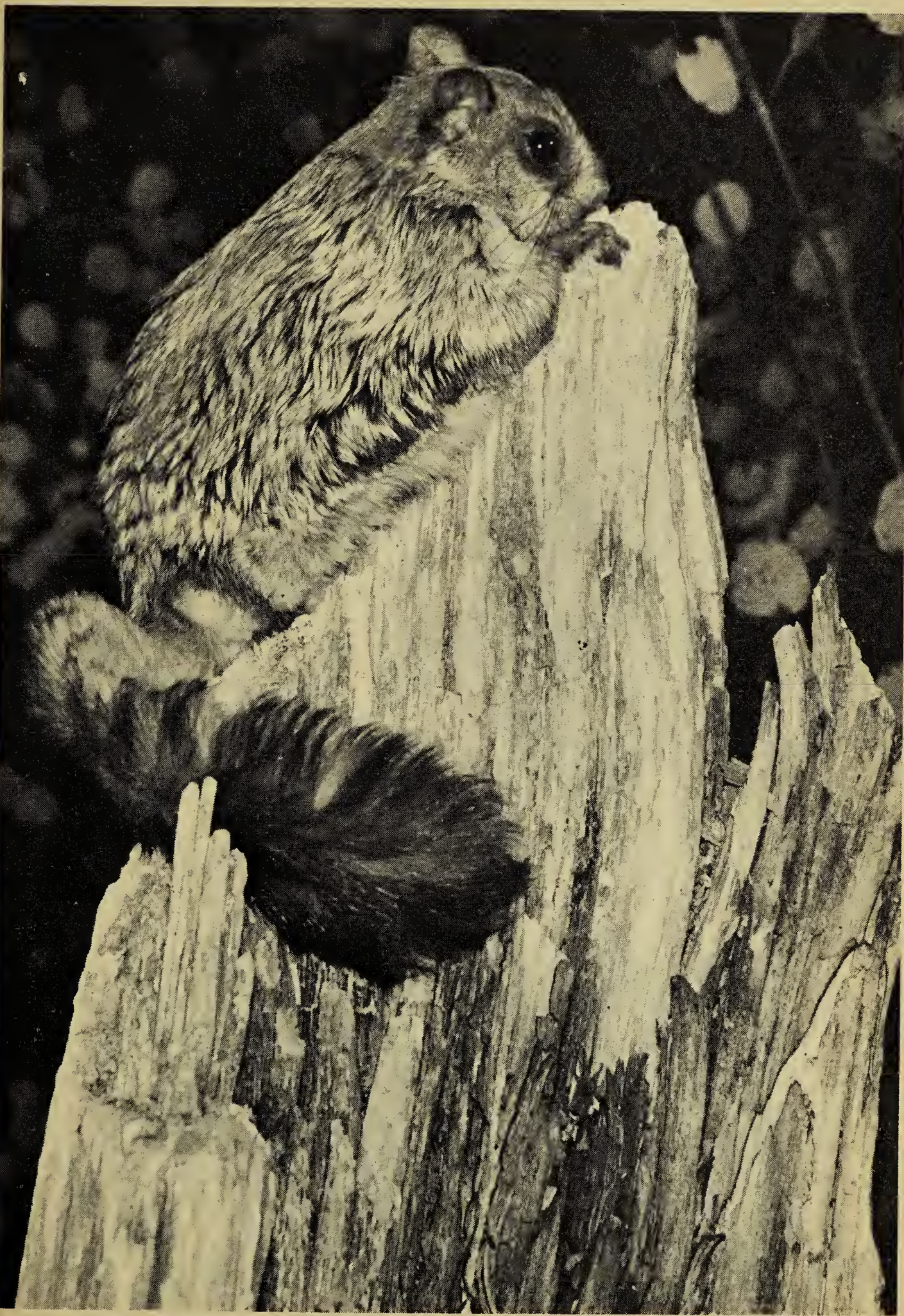
The Northern Flying Squirrel is nocturnal. The large eyes are a modification for seeing in dim light and the wide tail is important for checking speed and direction. During daylight hours they rest and nap. Their bedroom may be an old woodpecker's hole or an outside nest 20 to 30 feet above the ground.