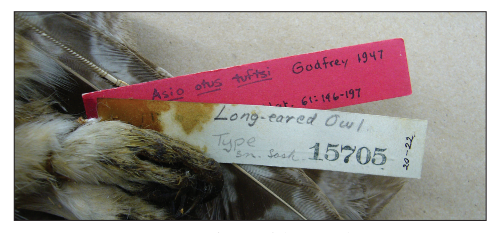
FIGURE 5. Labels attached to the type specimen of Asio otus tuftsi (CMNAV 15705), collected by Charles H. Young at Last Mountain Lake, Saskatchewan, 14 July 1920.

The collecting locality is given on the original label as Maple Creek, Saskatchewan (Figure 4), which is about 45 km southwest of the designated collecting locality, Crane Lake. This is another example of a subspecies described on the basis of incomplete information, albeit measurements were compared with individuals from other regions that showed that those of dwighti were larger, and its bill was more slender; however, sample sizes were too small for confirmatory statistical analysis. Bishop noted the "Cowbird breeding in Saskatchewan is considerably larger than in our Eastern States, as is shown by the subjoined measurements of breeding birds. The bird inhabiting Alberta, Manitoba, and northern Montana is doubtless the northern race, but I have not seen specimens from these localities." 2 Dwighti was not accepted by the AOU because it was "Too close to M. ater".64