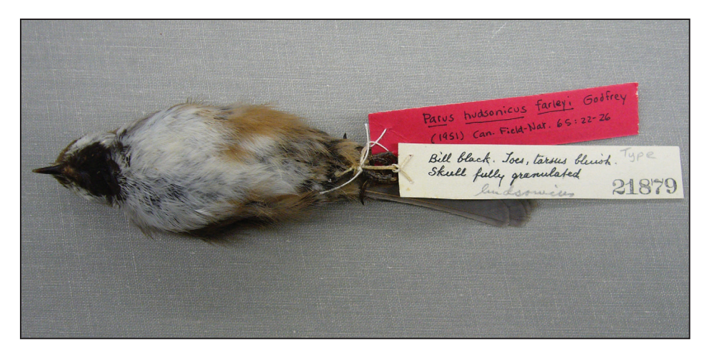
FIGURE 2. Type specimen of Parus hudsonicus farleyi (CMN 21879), collected by Hamilton M. Laing at Lac la Nonne, Alberta, 23 August 1926.

and foxed so drastically that in colour, particularly that of the pileum and other upper parts, they little resemble recently-taken specimens from the same locality." 44