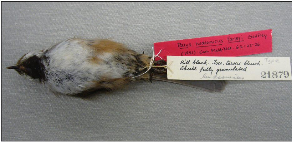
FIGURE 2. Type specimen of Parus hudsonicus farleyi (CMN 21879), collected by Hamilton M. Laing at Lac la Nonne, Alberta, 23 August 1926.

and foxed so drastically that in colour, particularly that of the pileum and other upper parts, they little resemble recently-taken specimens from the same locality." 44