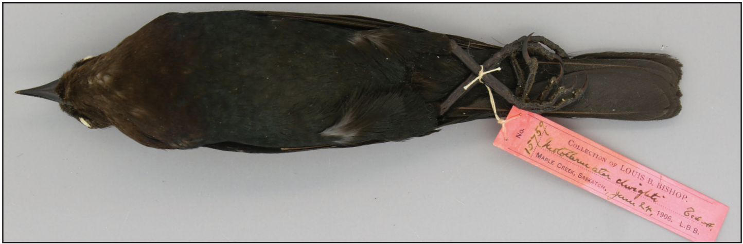
FIGURE 4. Type specimen of Molothrus ater dwighti (FMNH 15759), collected at Crane Lake, Saskatchewan, 24 June 1906.

overlap, making racial identification of specimens of unknown age and sex difficult". 9 Similar difficulties of separation of races had been noted for several subspecies discussed above.