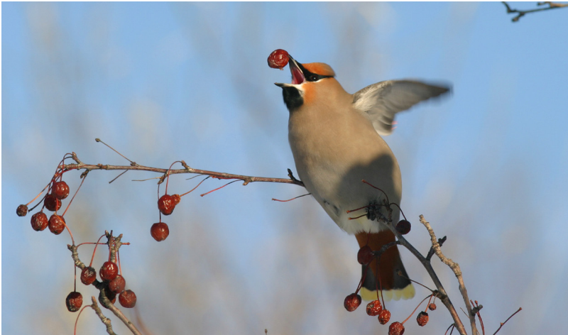
Top - Snow Bunting