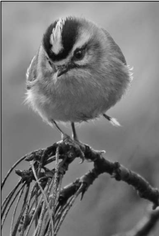
Golden-crowned kinglet (Regulus satrapa).