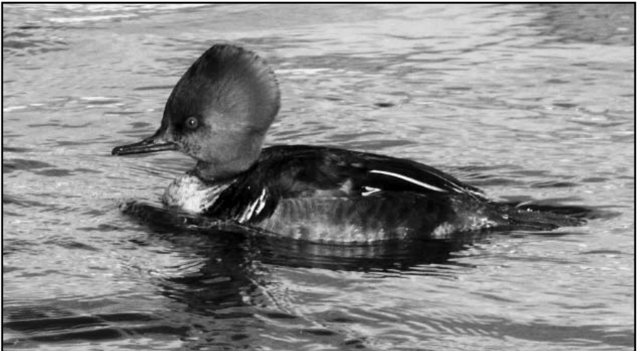
Hooded merganser (Lophodytes cucullatus) photographed shortly after the Craven Christmas count.