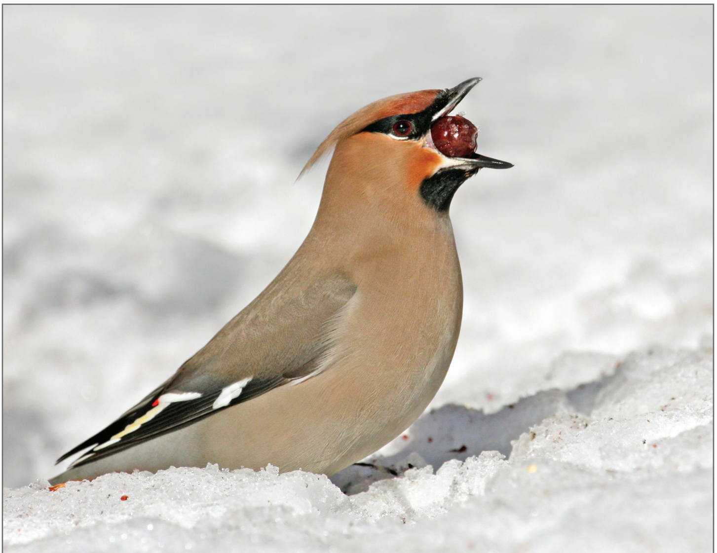
Bohemian Waxwing.