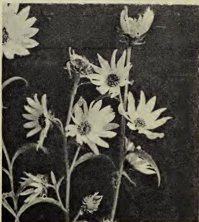
Narrow-leaved Sunflower, H. maximiliani