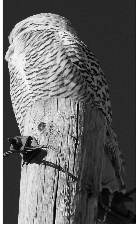
71 (3) September 2013