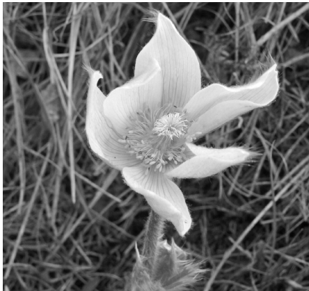
Figure 2. Prairie crocus (Anemone patens): top – typical flower form; mid – rose flower form; bottom – white flower form. (see inside front cover for colour images)