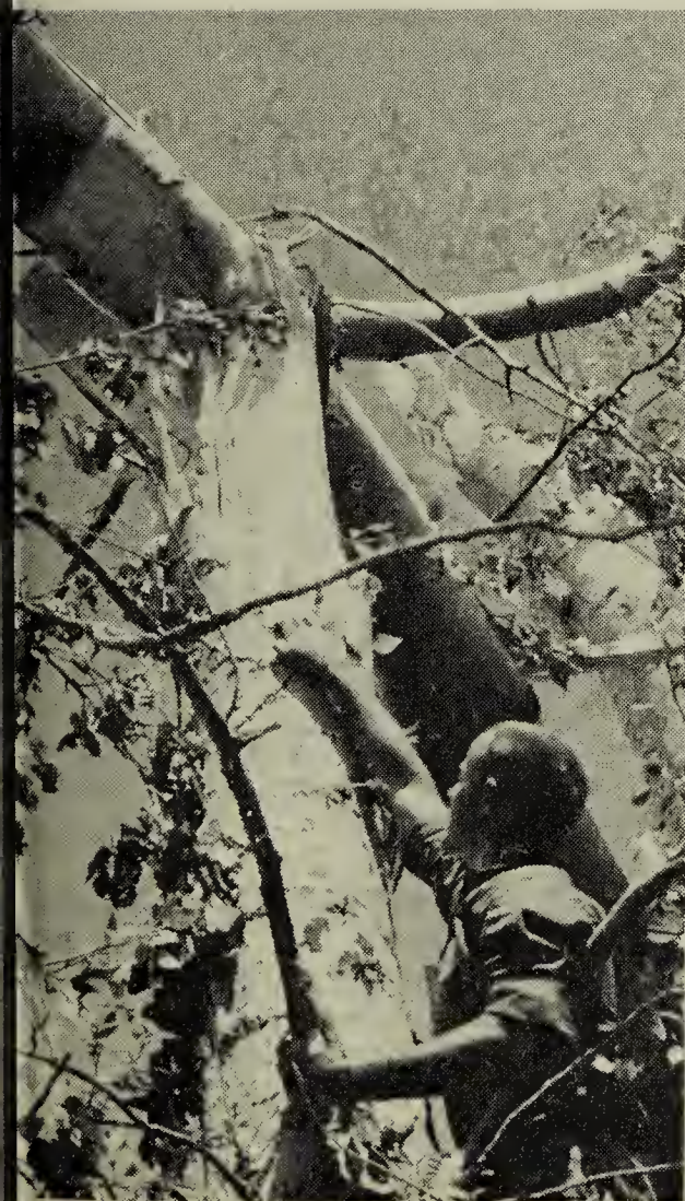
Aspen poplar splintered by the storm, six miles south of Regina Beach.