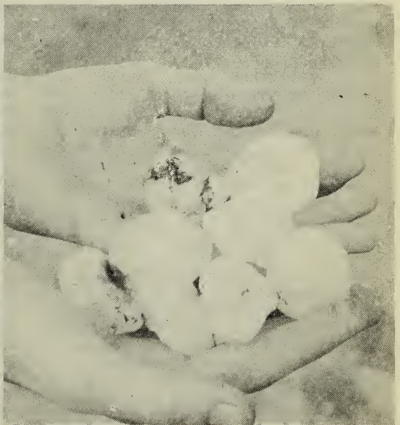
Hailstones collected at Boharm after the storm of July 17, 1957.