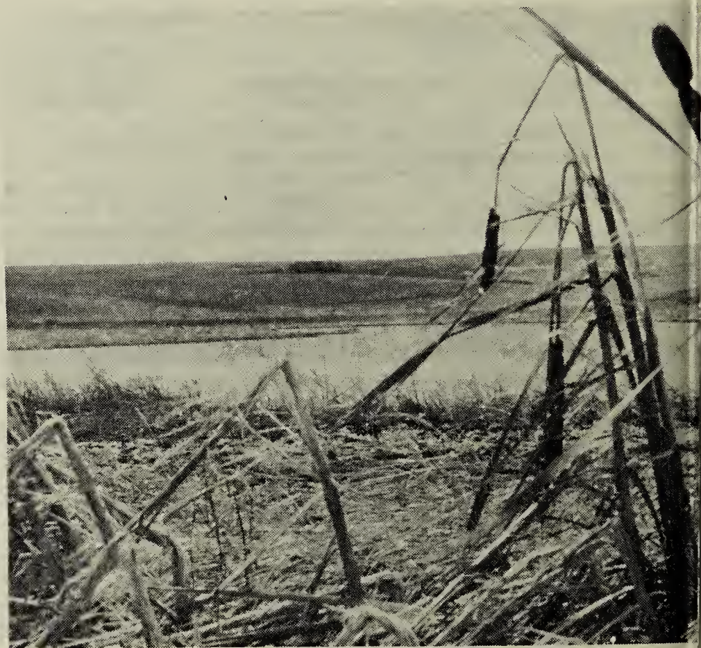
Cat-tails cut down by hail, 12 miles southwest of Regina Beach.